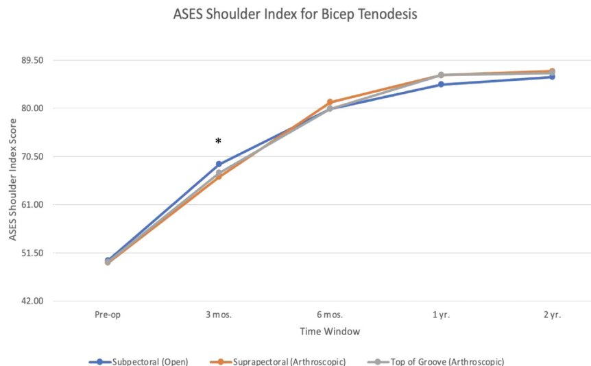
Fig 2. Graph displaying mean American Shoulder and Elbow Surgeons (ASES) Index scores among open subpectoral, arthroscopic low-in-groove suprapectoral, and arthroscopic top-of-groove groups over time. There was no statistically significant difference at any time point other than 3 months (asterisk, P = .0159 , analysis of variance [Kruskal-Wallis test]); however, the difference did not meet the minimal clinically important difference for biceps tenodesis. (mos, months; Pre-op, preoperatively; yr, year.)

Werner et al. 35 compared arthroscopic suprapectoral and open subpectoral interference screw fixation of the biceps long head. They concluded that the arthroscopic technique had a greater tendency to over-tension the biceps length-tension relation, and they reported better interference screw fixation at the subpectoral location owing to better screw purchase in diaphyseal bone. Average load to failure for the arthroscopic procedure was 138.8 \pm 29.1 N compared with 197 \pm 38.6 N for